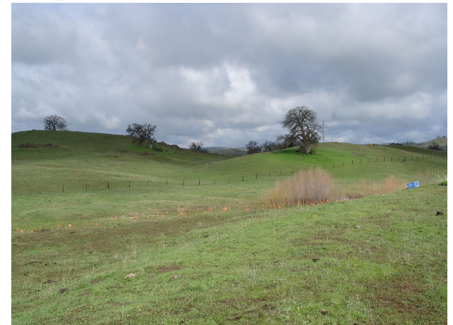
Cottonwood Creek Restoration Project

The mission and function of the SIERRA RESOURCE CONSERVATION DISTRICT is to take available technical, financial and educational resources whatever their source and focus or coordinate them at the local level to meet the present and future natural resource needs of the local land user.